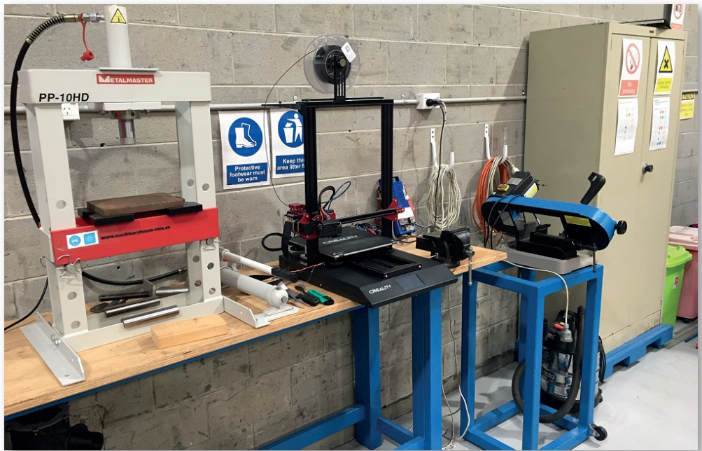
Above: We do not just order all of our parts online. Many of our projects require us to create our own parts. This is where all our equipment comes into use.