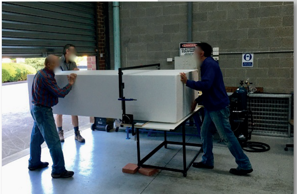
Above: Cutting a large piece of styrofoam requires teamwork.

Take a look at some other innovative solutions for reaching the unreached and isolated and see HFA 'at work'. >