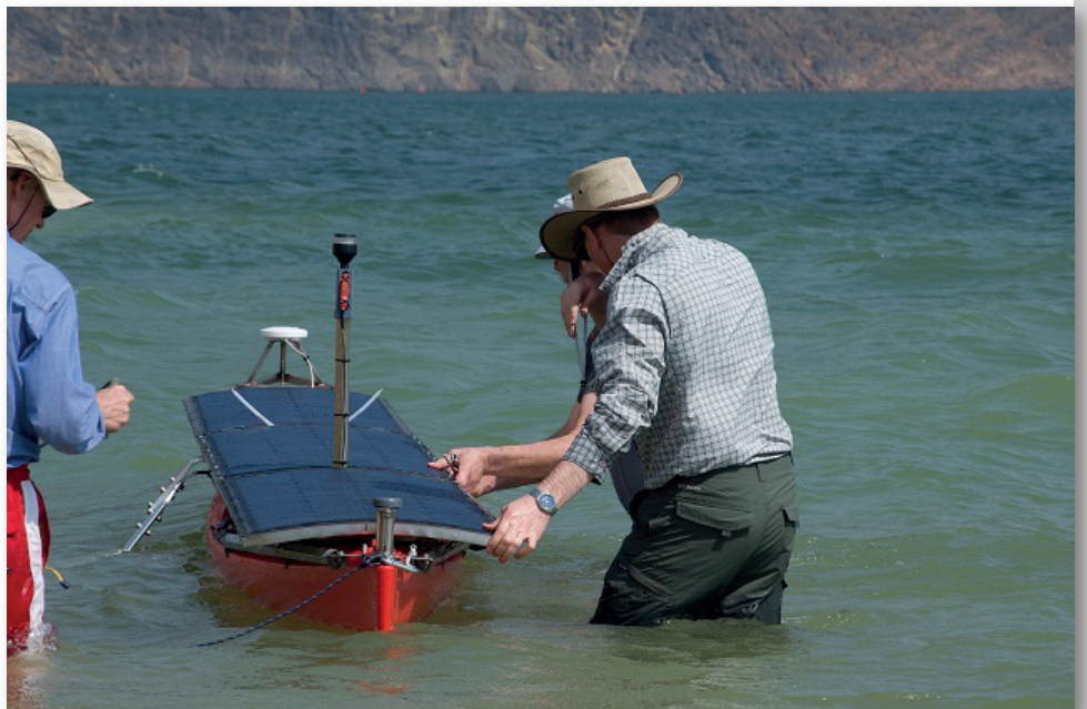
Below: The water-drone undergoing more tests – just one of HFA's innovative solutions.