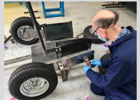
Water Drone Launch Dolly