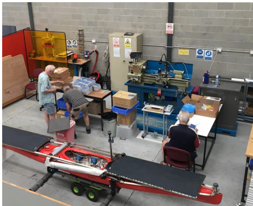
Volunteers Packing Bibles for Africa

May Jesus not only be the Saviour, but also the Lord of our lives!