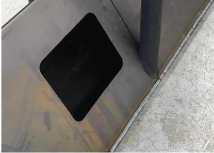
Welded Water Drone Structure

A painful experience as an apprentice had turned into a valuable and enjoyable skill to serve God! I felt privileged and started to thank God that He allowed me to go through that apprenticeship.