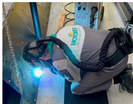
Metal Inert Gas (MIG) Welding

The pieces prepared for assembly matched the drawings exactly.