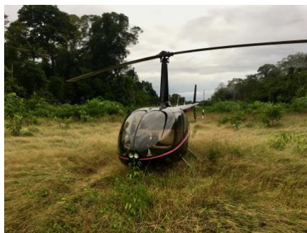
Rental helicopter for missionaries

May the Lord bless you and keep you throughout the year 2021!