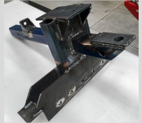
MIG Welded Part