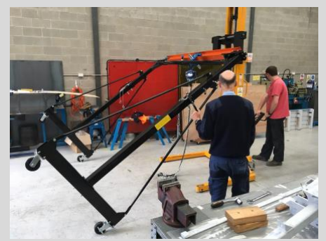
Gantry Crane Assembling