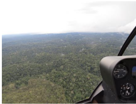
Endless jungles in South America

Later we realised that even if no one received a Bible and the project utterly failed, it would still be worth trying to bring the gospel to the nations, as an act of obedience and worship to Jesus.