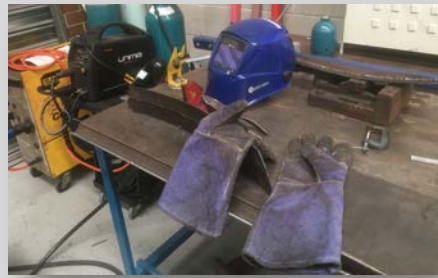
Sometimes you will find our project engineer in the office creating 3D models or ordering materials. At other times, you might find him donning some of the above gear in preparation for welding.