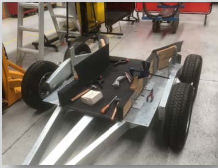
Final preparations on the dolly before water trials of waterdrone 2.0