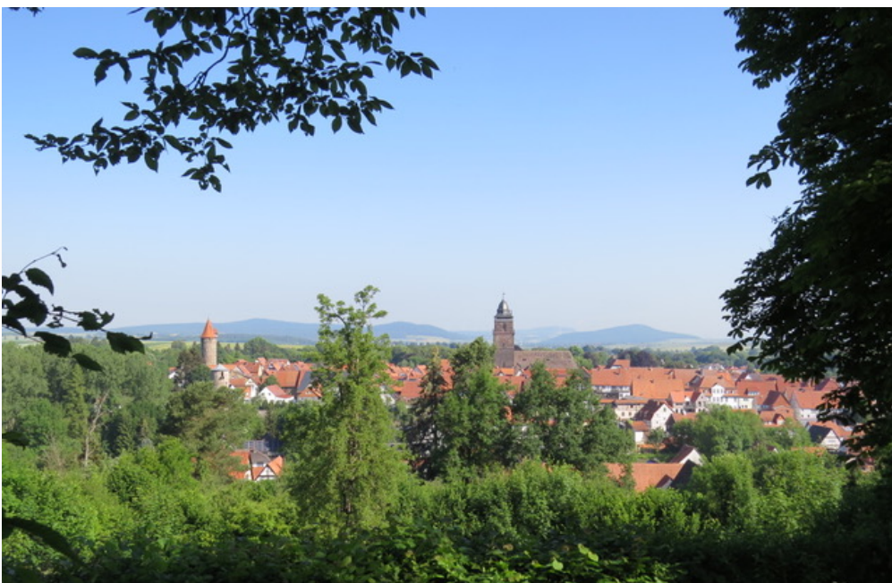
Our town in Germany.

We sure miss our wonderful team in Australia, but we're so thankful to be close(r) to our families, to rub shoulders with our Swiss and German network-partners, to once again raise awareness in churches for the plight of the unreached and isolated people-groups and to connect with our wonderful 'unseen team': the faithful prayer-warriors and supporters. I might not have come up with this change myself, but I praise God for it!