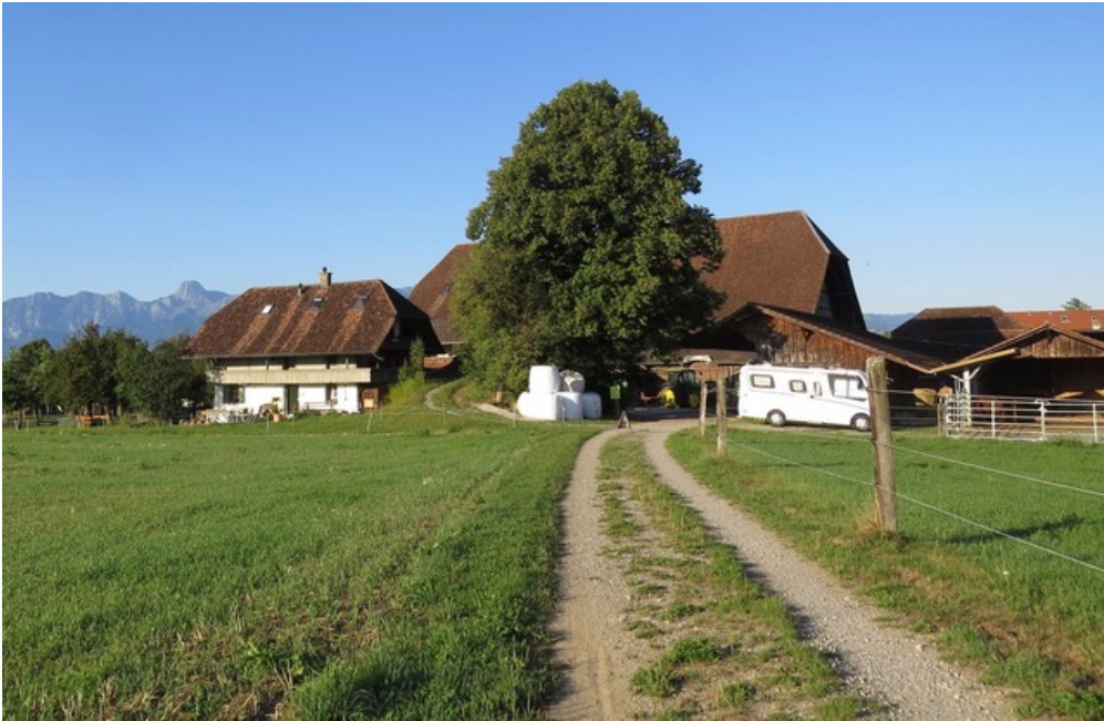
Our 'main base' in the Bern area of Switzerland & our mobile home.