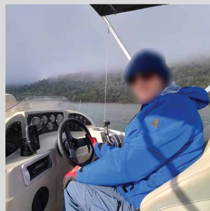
Piloting the support craft for final trials at the lake.