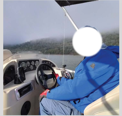
Piloting the support craft for final trials at the Lake.

“The purpose of Hope From Above Inc. is to help bring the gospel to unreached and inaccessible people groups, overcoming their isolation through aviation and technology, where no other alternatives are available, and without which, these people would remain unreached.”