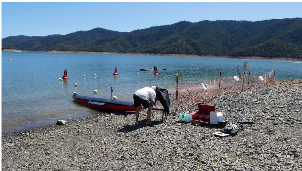
For boat testing, the IT specialist had to be creative to see the screen in the bright sunlight.

Arriving at the capital after my trip half-way around the world, I received a very warm welcome. Shortly after, our partner organisation and several other invited guests met in an outside courtyard for a seminar. I soon found out: in South America nothing much moves without food and lots of talking.