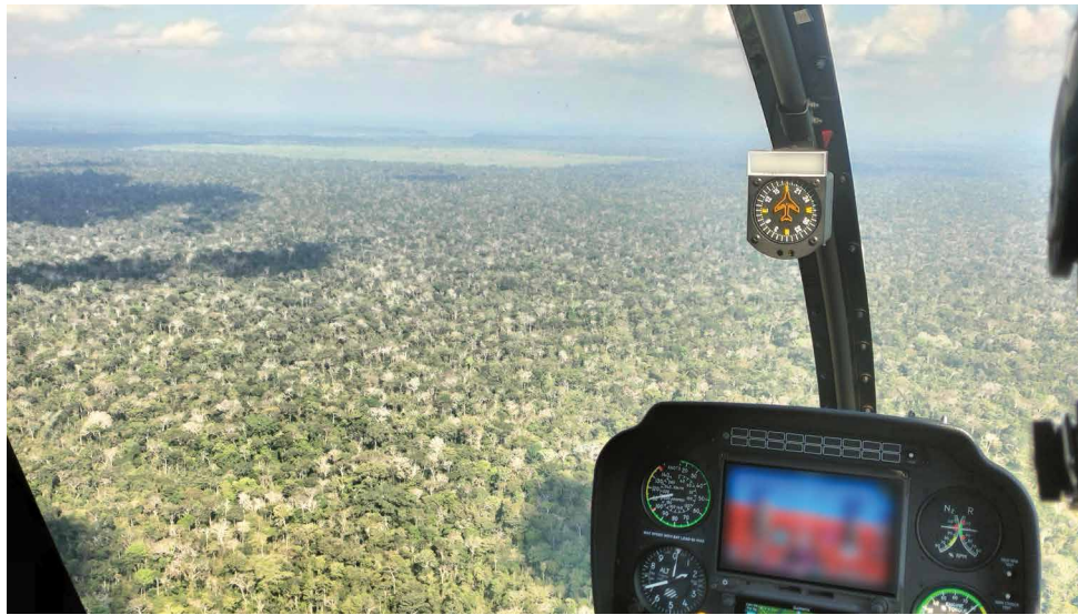
Flying over the seemingly endless jungle.

small hangar with an even smaller aeroplane inside. As we'd have to fly low over the jungle for a reconnaissance flight, John had to stay behind to reduce the weight on the aircraft. Next, our team members were unscrewing parts from the plane to fit cameras and stuffed batteries into the wings. To the uninitiated it appeared like we were modifying a perfectly good aircraft! Then we flew. The cameras worked, the weather was great, and the visit to a village, amazing. We returned after a day flying with the footage we needed. Flying over the jungle I hadn't seen many signs of life or tribal huts but that's why we were using 360° cameras. While the flights only take a few hours, the painstaking work that follows takes days of looking at the computer screen, scrolling through the footage in three strips for each flight and rolling the camera angle back and forth, almost creating a 3D