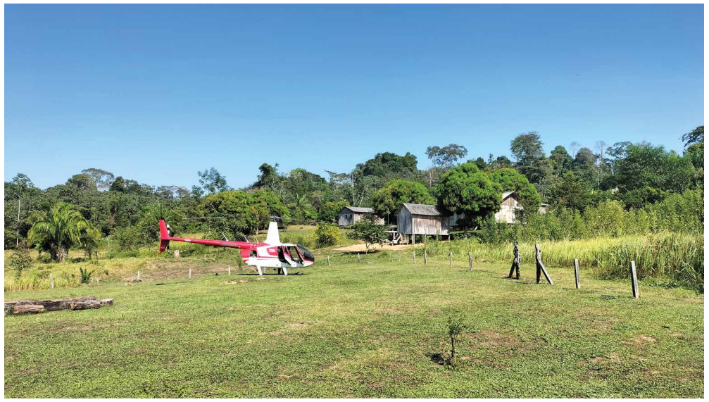
Visiting isolated jungle-station only accessible by helicopter and boat.

After flying again domestically, gaining an upset stomach and ensuring a total lack of sleep we were 'ready' to fly in a small missions-aircraft. Praise God, my symptoms subsided. We arrived at a