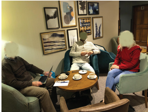
'Brains trust' meeting for network partnership

Potentially, there is a world-wide network of skills waiting to be tapped into. Even those tiresome time zones that can make things difficult at times can be used to our advantage. When there was a hitch while working on the hulls of the two latest water drones in Australia earlier in the year, the team asked a HiL engineer in Switzerland for help and went to bed. The Swiss team-member then used his workday to find a solution to this problem, with new drawings ready for the next morning's work in Australia.