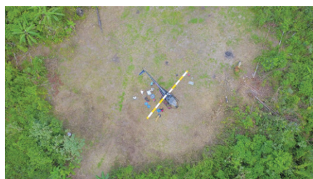
Helicopter to the isolated jungle station: a short trip with a long-term impact!

Living at the jungle station outside the demarcation line, David had continued to translate Bible portions for decades.