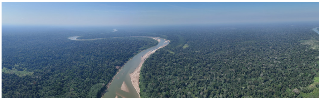
Vast untouched expanses of the jungle, searching for unreached communities