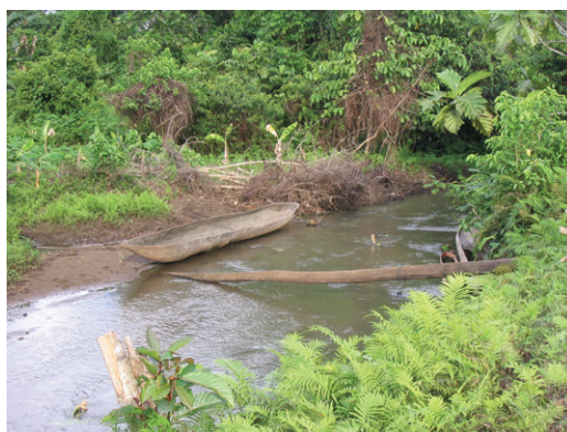
Local jungle transport