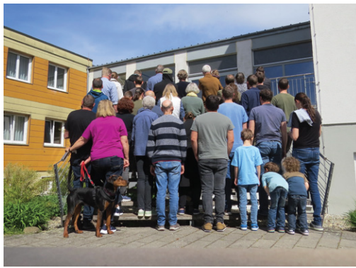
'Secure' group photo of European Network gathering

We returned home encouraged, knowing that setting up a network organisation is possible and now have a better understanding of the teams we work with. Even though we are separated geographically, we're even more connected in our hearts and common goal as we serve together with our unique gifts and abilities. This is truly a team co-labouring together for Christ. When the team in Australia come to the end of their skills and resources for a task, they can seek help from Switzerland or the Netherlands, Germany or the UK.