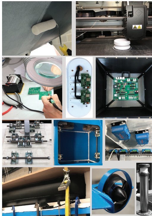
Water drone construction: parts and components

Our team is working hard to complete the next water drone. Insights gained from our prototype have been integrated: a 'tweaked' shape design, upgraded electronics for enhanced vessel operation and accuracy. Please join us in prayer for God's protection and unhindered progress, as we push towards launching this craft; that we may bring Light into dark places!